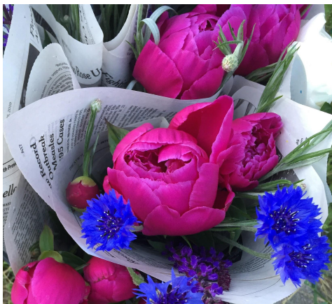
$5 Multicrop Example 2 Peony + 3 Bachelor Button