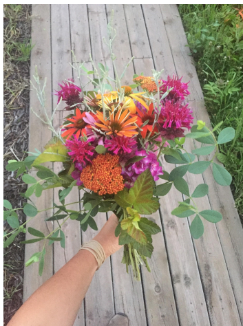
$10 Multicrop Example note greens + herbs