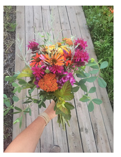
$15 Multicrop Example 5+ Lrg dahlias, filler/greens

$10 Multicrop Example note greens + herbs