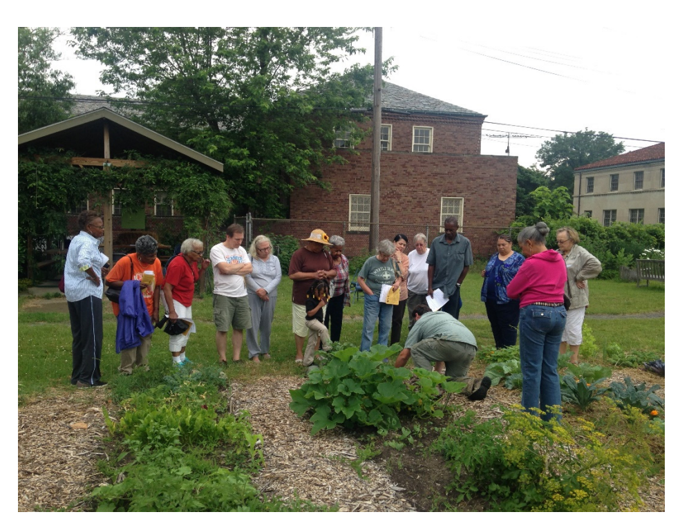
Figure 1. Garden Resource Program members attending a gardening class.