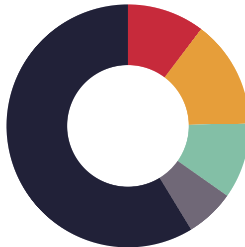
2023 Revenue $1,671,539